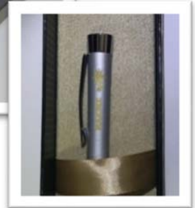
Stainless Steel Parker Pen: $45

Ballpoint pen, engraved with "RAEME" and the Corps Logo