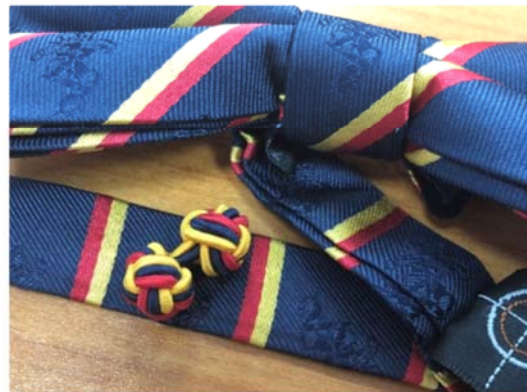
RAEME Silk Tie and Bow Tie: $30

RAEME silk tie and bow tie in dark blue, with yellow and red stripes and interwoven Corps Logos. Constructed of woven silk, the bow ties have either a pre-tied knot and metal clasp attachment, or unknotted with an adjustable strap.