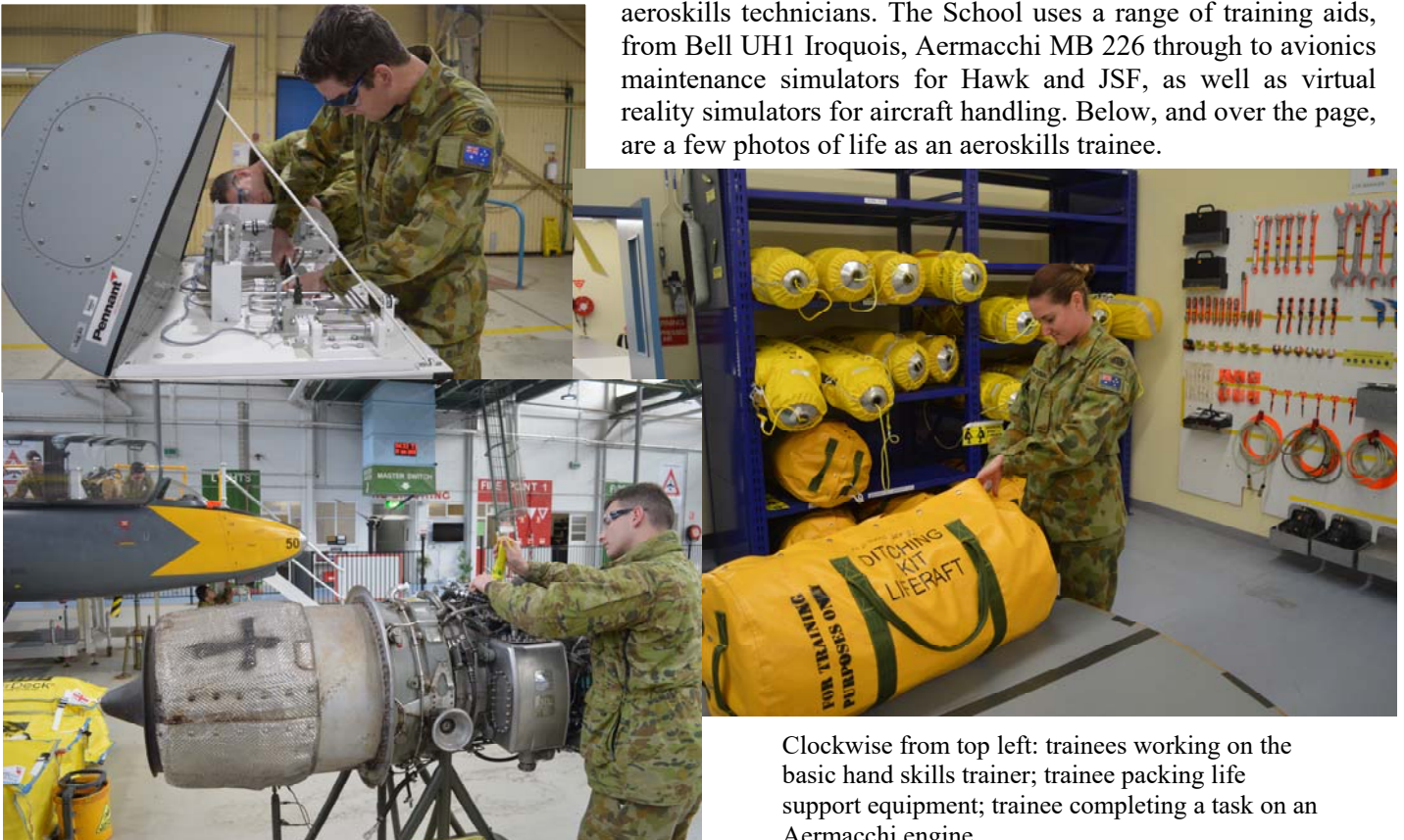
Clockwise from top left: trainees working on the basic hand skills trainer; trainee packing life support equipment; trainee completing a task on an Aermacchi engine.

The Royal Australian Air Force School of Technical Training (RAAF STT) conducts the initial trade training for aircraft maintenance for the RAAF, Navy and Army. RAEME aeroskills technicians complete their initial trade training here, prior to conducting their aircraft specific courses at the Rotary Wing Aircraft Maintenance School (RAMS). In 2019, RAAF STT is celebrating 50 years of training RAEME aeroskills technicians. The School uses a range of training aids, from Bell UH1 Iroquois, Aermacchi MB 226 through to avionics maintenance simulators for Hawk and JSF, as well as virtual reality simulators for aircraft handling. Below, and over the page, are a few photos of life as an aeroskills trainee.