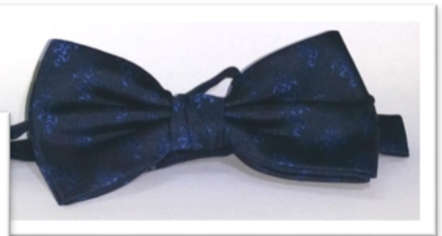
RAEME Blue Bow Tie: $30

RAEME silk tie and bow tie in dark blue, with yellow and red stripes and interwoven Corps Logos. Constructed of woven silk, the bow ties have either a pre-tied knot and metal clasp attachment, or unknotted with an adjustable strap.