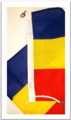
The Flag, Identification, Workshop: $125

The RAEME Flag and the Flag, Identification, Workshop (Tricolour) for sale are designed and constructed in accordance with the Army Ceremonial and Protocol Manual and RAEME Corps Instructions. The flags are fully sewn and feature metal fitments. The RAEME Flag is constructed using the new RAEME logo.