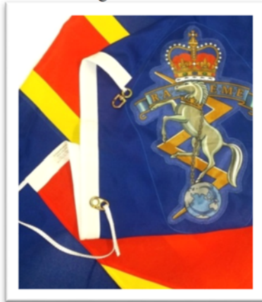
The RAEME Corps Flag: $395

Dimensions: 1800×900 mm Manufacturer: Carroll & Richardson