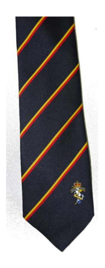
RAEME Association Corps Tie Design introduced circa 2009